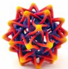
VisiJet PXL + Wax infiltrant for fast, affordable, beautiful color models