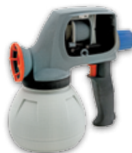
VisiJet PXL + StrengthMax infiltrant to dramatically improve the strength of this paint gun ergonomic prototype