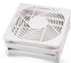
VisiJet PXL + Salt Water infiltrant, ideal for very economical monochrome models

Choose from a range of finishing options to meet your application requirements, from ColorBond infiltration for stronger functional prototypes to wax for creating concept models quickly, safely and affordably.