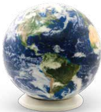
Multi-color globe model 3D printed with gradient blending.

Warranty/Disclaimer: The performance characteristics of these products may vary according to product application, operating conditions, material combined with, or with end use. 3D Systems makes no warranties of any type, express or implied, including, but not limited to, the warranties of merchantability or fitness for a particular use.