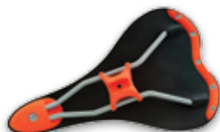
VisiJet PXL + ColorBond infiltrant for improved strength and color vibrancy of this bicycle seat model